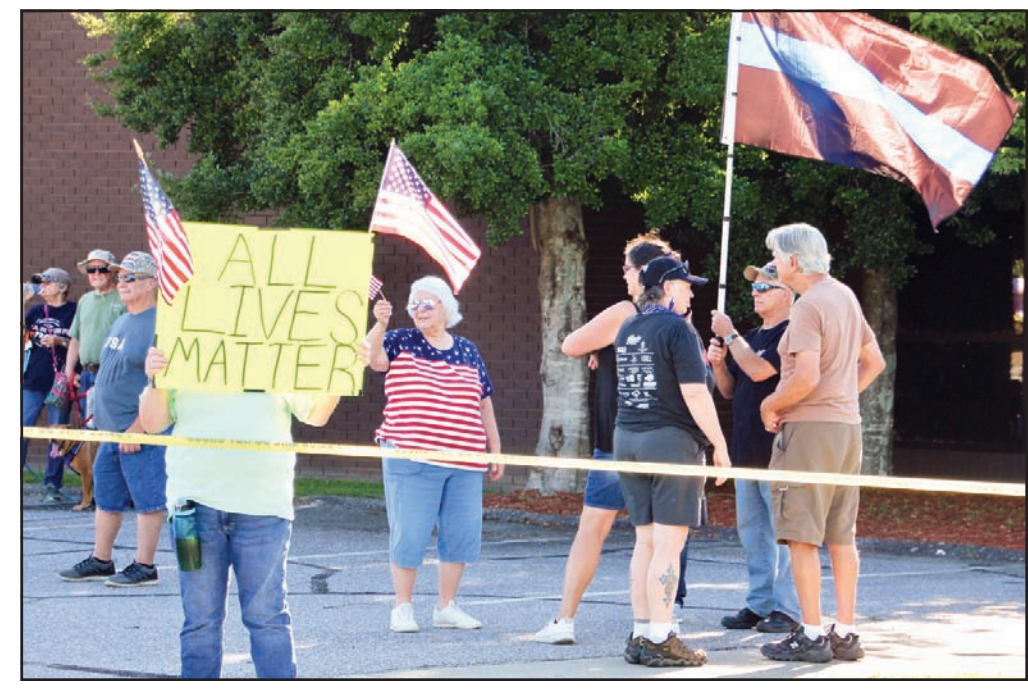
About 75 people attended the "All Lives Matter" rally Saturday at the courthouse.

Several people made public remarks at the rally, including two scheduled speakers and others who felt moved to speak, though the See Rally, Page 6A